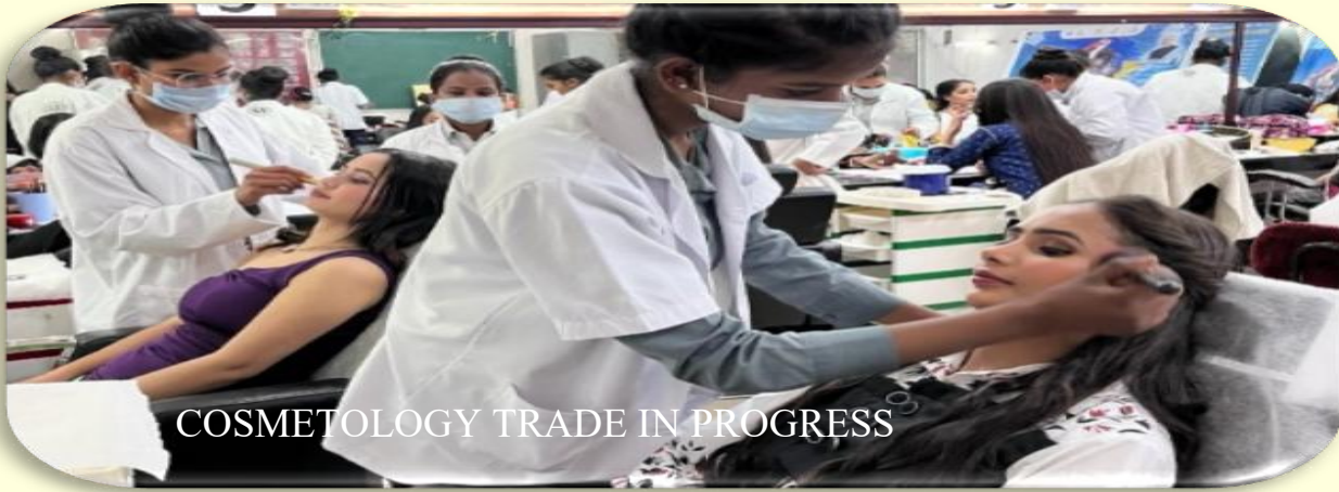
COSMETOLOGY TRADE IN PROGRESS