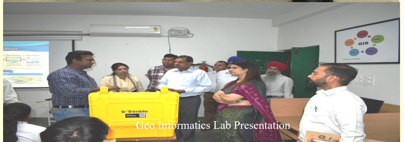
Geo-Informatics Lab Presentation