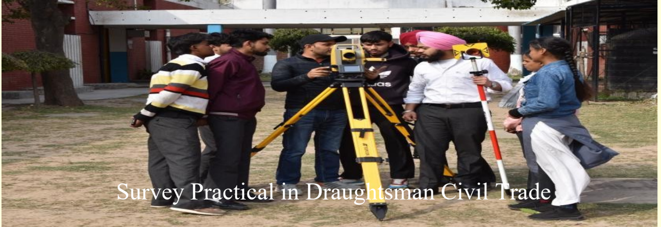
Survey Practical in Draughtsman Civil Trade