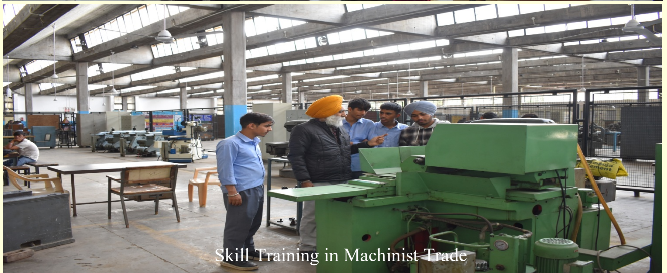
Skill Training in Machinist Trade