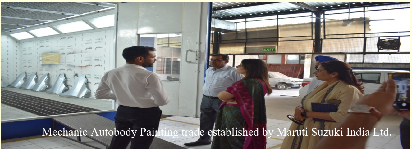
Mechanic Autobody Painting trade established by Maruti Suzuki India Ltd.