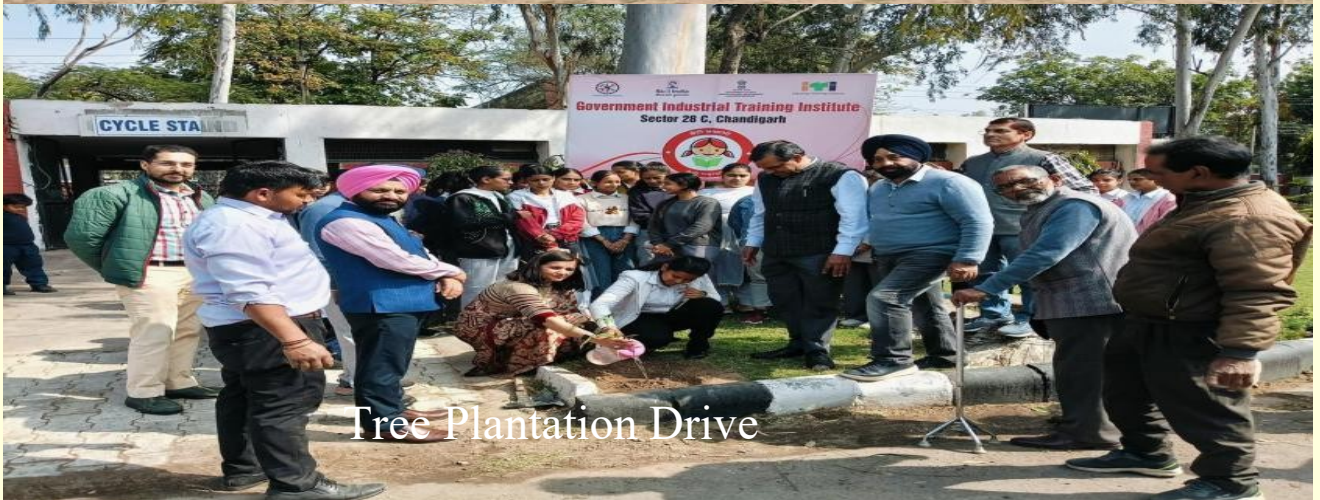
Tree Plantation Drive