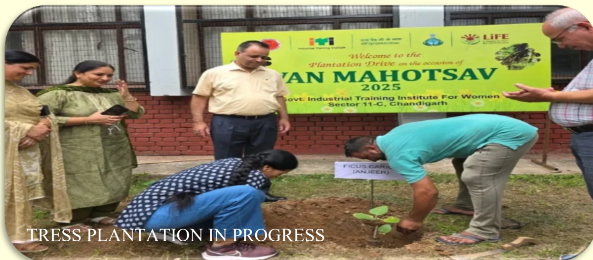
TREE PLANTATION IN PROGRESS