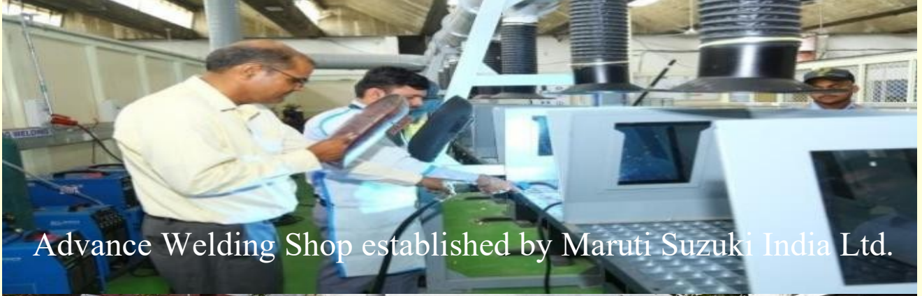
Advance Welding Shop established by Maruti Suzuki India Ltd.