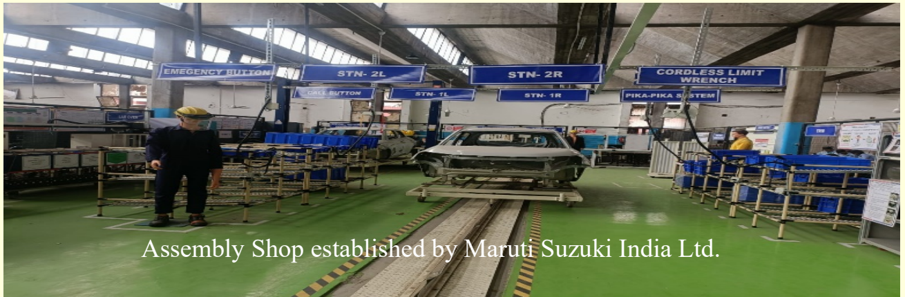
Assembly Shop established by Maruti Suzuki India Ltd.