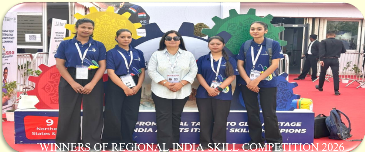
WINNERS OF REGIONAL INDIA SKILL COMPETITION 2026