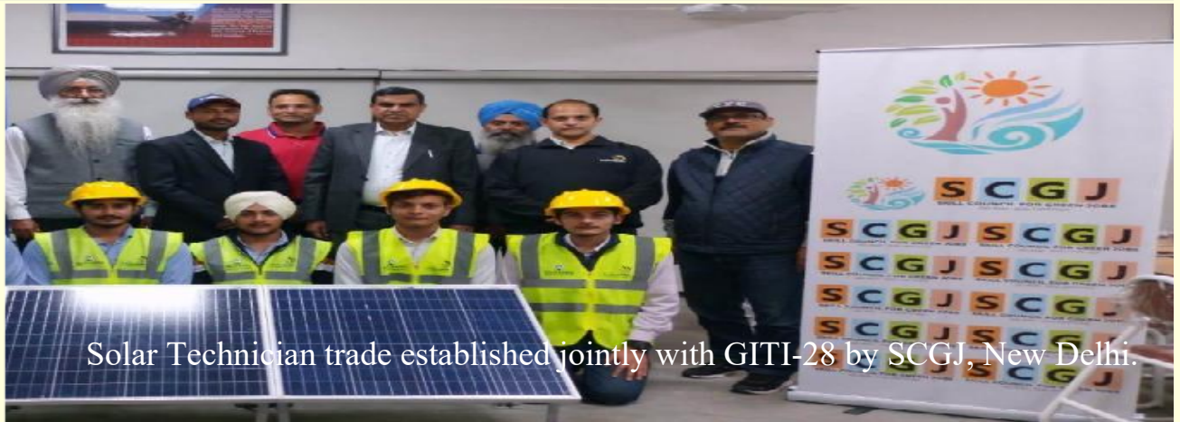
Solar Technician trade established jointly with GITI-28 by SCGJ, New Delhi.