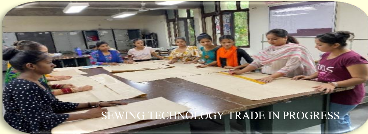
SEWING TECHNOLOGY TRADE IN PROGRESS