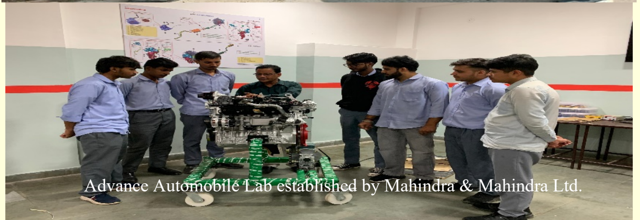
Advance Automobile Lab established by Mahindra & Mahindra Ltd.