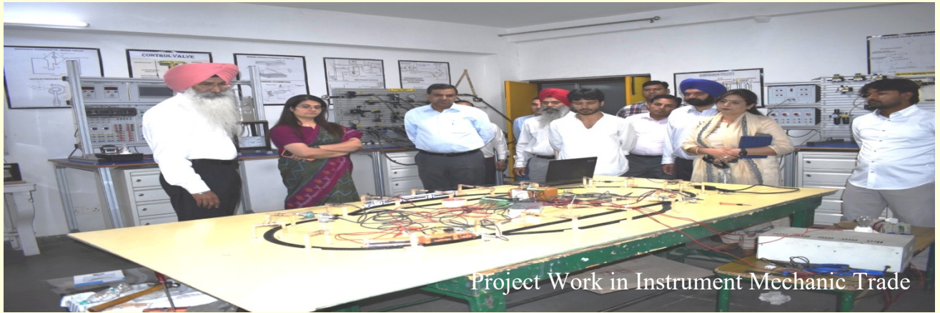
Project Work in Instrument Mechanic Trade